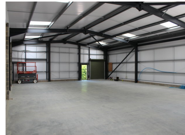
Photo of an adjoining unit at completion of the units in 2023.

Properties get a rating from A+ (best) to G (worst) and a score.