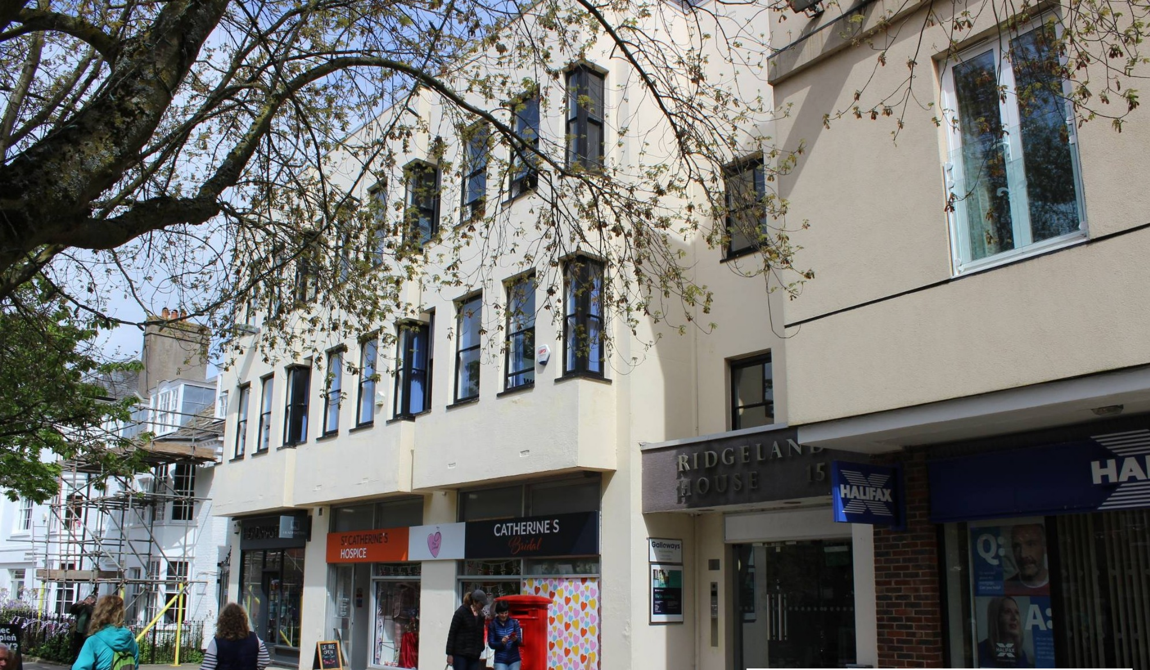
RIDGELAND HOUSE, 15 CARFAX, HORSHAM, WEST SUSSEX, RH12 1ER