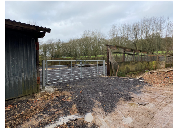
Unit E3 with storage container.